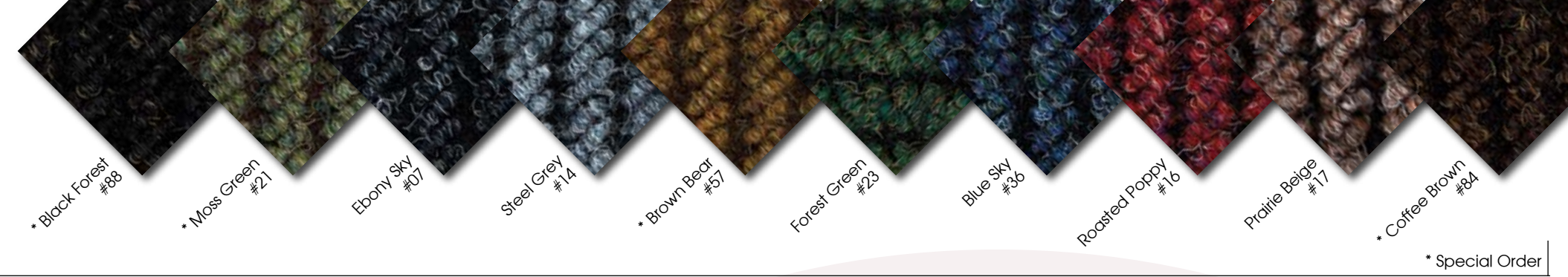
Slant Modular Tiles