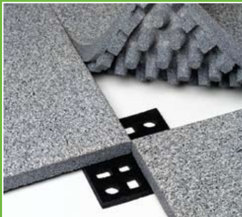
Quad Blok System

Our exclusive Quad Blok™ system, available only for PlayGrind 2-1/2" thick tiles, offers reliable easy-down/easy-up installations. Unlike labor-intensive poured-in-place systems, Quad Blok modular connectors are quick and easy to use without adhering to or causing damage to playground substrates. If an individual tile ever does need replacement, removing and securing a new tile causes minimal disruption or downtime. An added benefit for rooftop projects: attaching tiles to the Quad Blok and not the roof itself eliminates costly damage to elastomeric membranes.